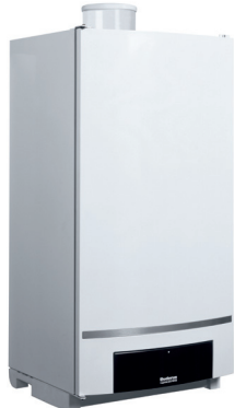
GB162 Wall Mounted Condensing Boiler 290,000 - 333,000 BTU/hr