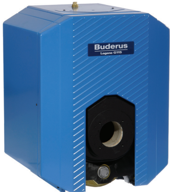
G115 - 215 - 315 Oil-Fired Boilers 85,000 - 768,000 BTU/hr