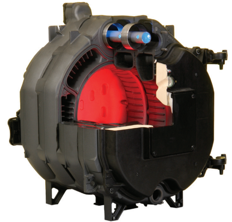
G315 Series 350,000 - 768,000 BTU/hr