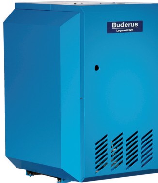
G124X - 234X - 334X Gas-Fired Boiler 74,000 - 542,000 BTU/hr