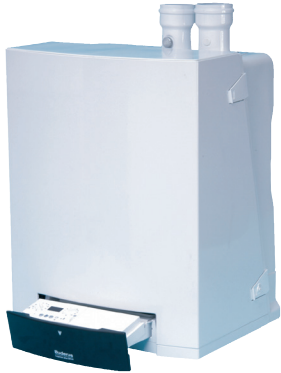
GB142 Wall-Hung Condensing Boiler 84,000 - 218,000 BTU/hr