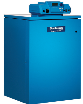
GA124 - 244 Sealed Combustion Boiler 70,000 - 212,000 BTU/hr