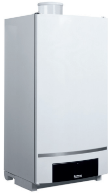
GB142 - GB162 Wall Mounted Condensing Boilers and Cascade Components 84,000 - 1,332,000 BTU/hr