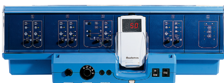
Logamatic 4000 Control